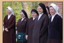
Carmelite Sisters for the Aged and Infirm, Germantown, NY

Breakdancing! Family Holy Hour for Life! Free Lunch! Free Gifts!